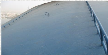
Safety Handrail installations for safe maintenance.