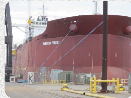
We provide mooring lines as well as mooring winch services on all vessels, including cargo and tanker ships.