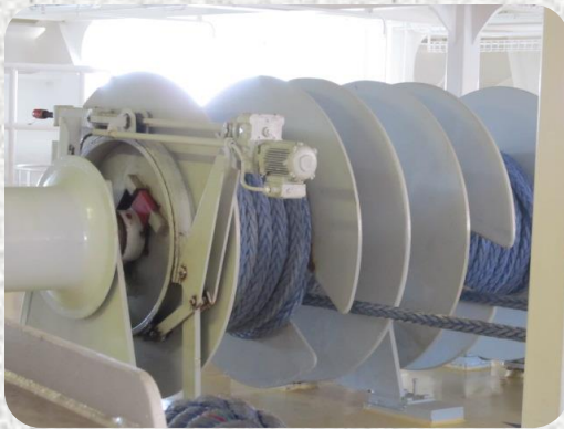
Specifically designed equipment and experience allow for a job well done, guaranteed.